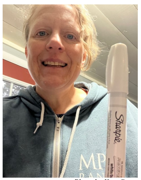
My friend Beth from Sacajawea Audubon gave me this oil-based paint marker and the instructions for drawing vertical lines on my windows. I'm so happy to give it try!

be easily removed if needed. We will also provide people with science-based instructions for using the markers.