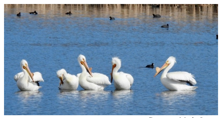
American White Pelicans, with American Coots in the background, at on a previous WBWD.

Mark your calendars: Bitterroot Audubon will be welcoming back waterfowl and wonderful birders at Lee Metcalf Wildlife Refuge on Saturday, April 20, 2024. We'll meet on the dike west of the Visitor's Center from 10AM-1:30PM. We'll observe the waterfowl, other birds, and mammals that use the refuge wetlands; we'll help the public identify what we see. This special event is for everyone. Bring binoculars, a scope (if you have one), and warm clothes.