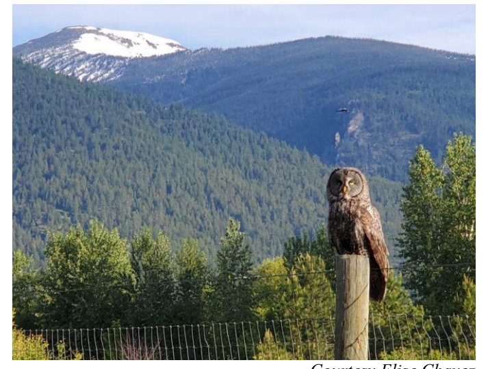
Great Gray Owl at Big Creek Ranch with St. Mary's Peak in the background.

comes into view, 2977 Mittower is on the right. Pull in and park on either side of the driveway. We will begin near the house with the American Goldfinches, Hairy and Downy Woodpeckers, Nuthatches (three varieties), Chickadees and Great Horned Owls. We can then walk through the towering Ponderosa Pines along Big Creek where the Great Blue Herons and the Belted Kingfishers feast, and the Clark's Nutcrackers, Stellar Jay's and Northern Flickers holler at each other. Then we'll make our way out into the meadows and hopefully catch site of our resident Great Grey Owls and American Kestrels hunting voles. The Killdeer will no doubt be showing us their broken wings and the fat American Robins and proud Western Meadowlarks will make lovely background music. And we may hear the Sandhill Cranes in the field next door and the geese overhead making their way to the refuge. We often have Bald Eagles peering down into the chicken yard wondering at the odds. Usually, a Murder of Crows isn't too far off and we can't avoid the European Starlings or the Turkey Vultures. We feel lucky to live in a place with such bird bounty and we are excited to share this experience with the BAS folks.