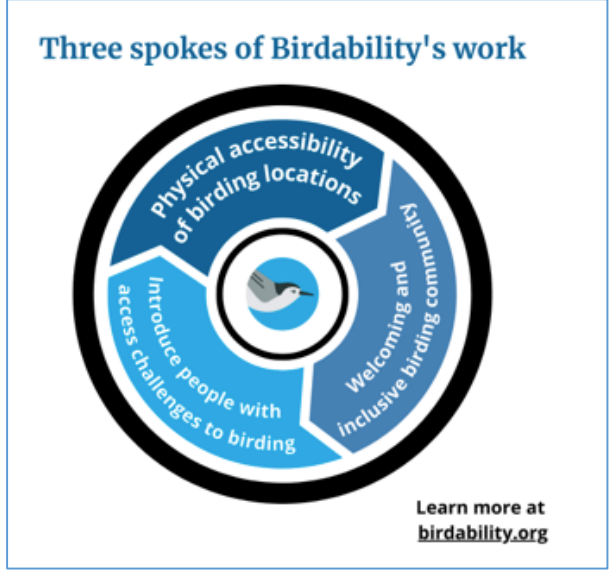
Graphic from the Birdability website. Birdability's mission is threefold, ensuring birding is inclusive, accessible, and welcoming to all.

face when they venture outside to bird. Perhaps you use a walker and also have impaired vision. Is the trail flat? Are there steps? Is there a bathroom you can access easily? Will you find a handicapped parking spot? If you're not sure about the answers to any or all of these questions, you might just decide to stay home rather than risk disappointment or an unsafe experience.