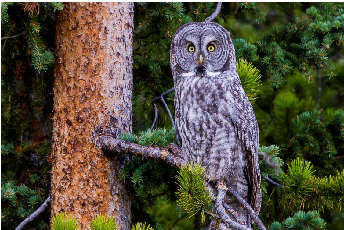
Great Gray Owl.