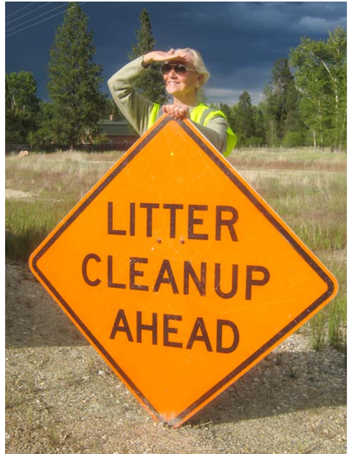
Highway clean-up volunteer.

Our semi-annual highway clean-up project will take place on October 16 at 5PM. Meet on the west side of Highway 93, near mile marker 64, south of Stevensville. There is a fair amount of trash along our stretch of road so please come out and help make us look good! We'll supply orange vests for everyone, but bring your own gloves. For questions contact Skip Horner at 642-6840 or skip@skiphorner.com