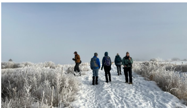
A foggy, frosty start to the Hamilton CBC on the Maki Ranch. The group searches for American Tree and Song Sparrows along Willow Creek.