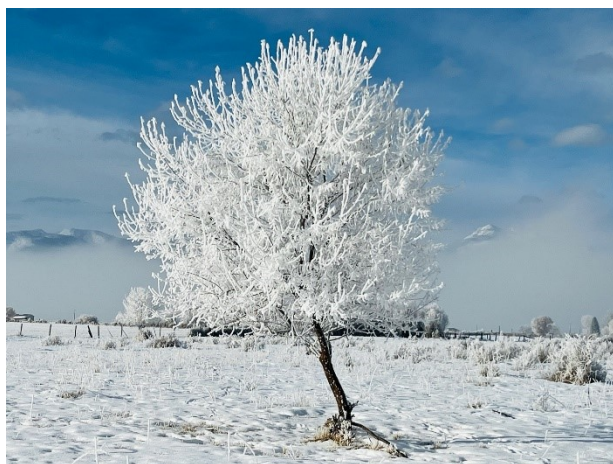
Frosted beauty on the Hamilton CBC.