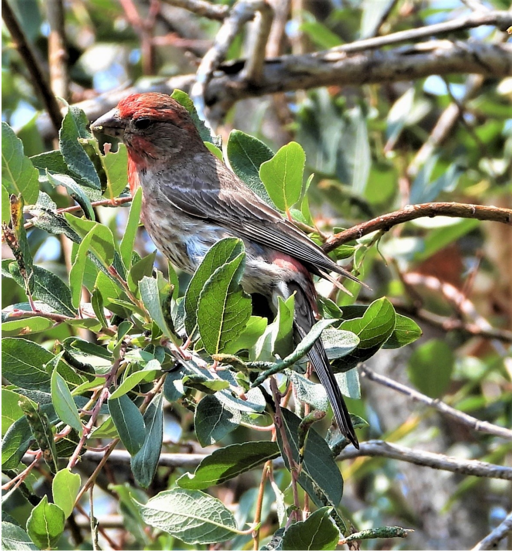
House Finch with grub in its bill. Corvallis, MT.