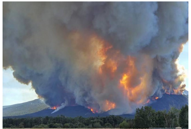
Roaring Lion Fire, 2016