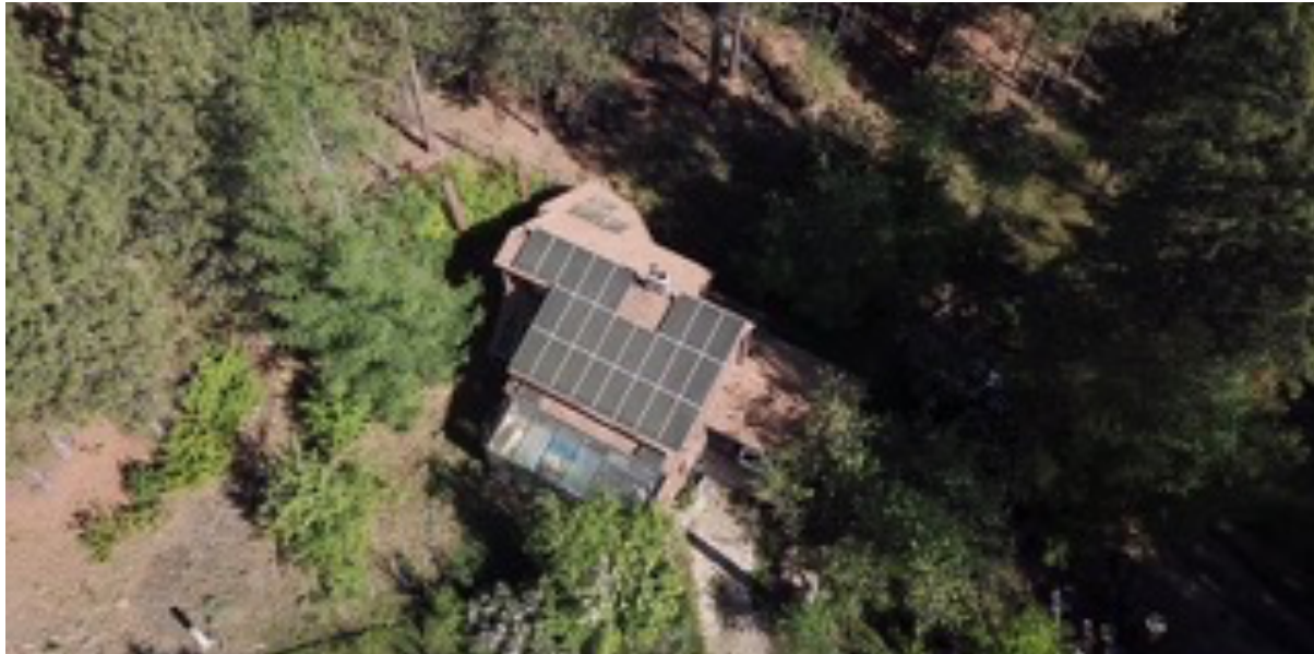
Local Solar Project Designed & Installed by SBS Solar”