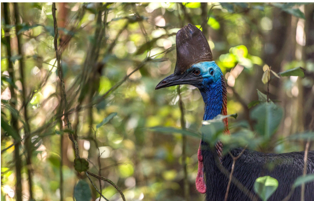
Southern Cassowary.

Their bodies are covered in dark feathers with colorful bright blue, purple, red and/or yellow-orange featherless skin on the face and neck, with color combinations depending on the species. They have three toes, with a sharp pointed straight dagger-like claw on the inside toe of each foot, which they use as weapons. Cassowaries are likely not a bird you would want to meet in a dark forest. They actually are known as dangerous because the larger cassowaries have been reported to have attacked and killed people. Finally, they closely resemble Corythoraptor (meaning crested raptor) an oviraptorid theropod dinosaur.