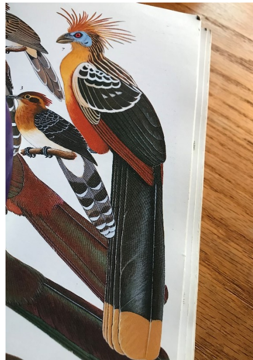
Plate from "The Birds of Ecuador," by Ridgely & Greenfield, 2001. Cornell University Press.

leaves and fruit which then sits in its gut fermenting before final digestion. This partially digested mash stinks, creating an obnoxious odor that keeps predators away. Thus its colloquial name: Stinky Turkey.