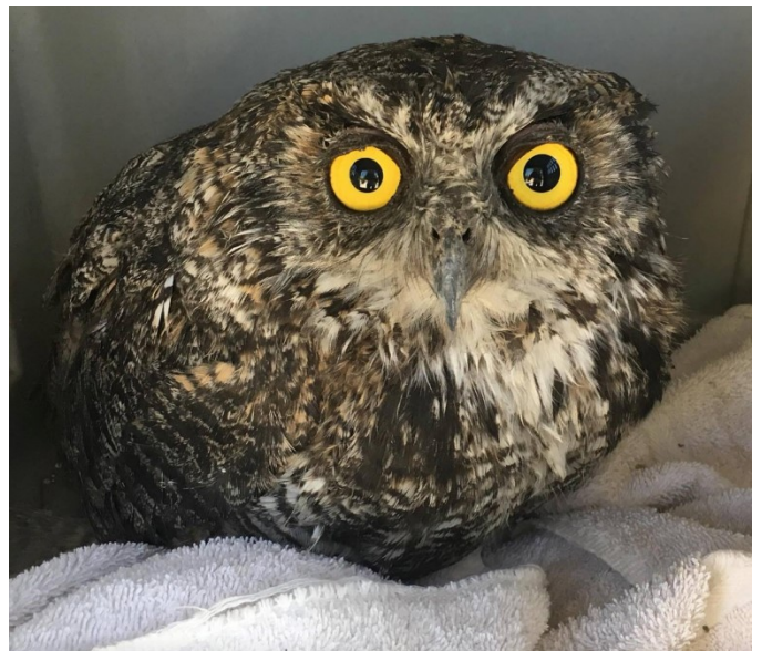
Injured animals like this Great Horned Owl are often captured and transported by our local game wardens.