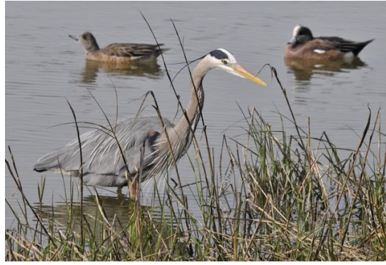
GREAT BLUE HERON AND AMERICAN WIGEON