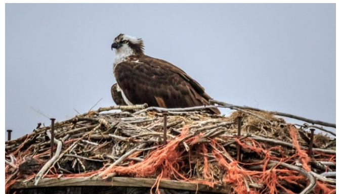
Osprey nest with baling twine.

If you use Facebook or Instagram, please look for Bitterroot Audubon and “Like” us!