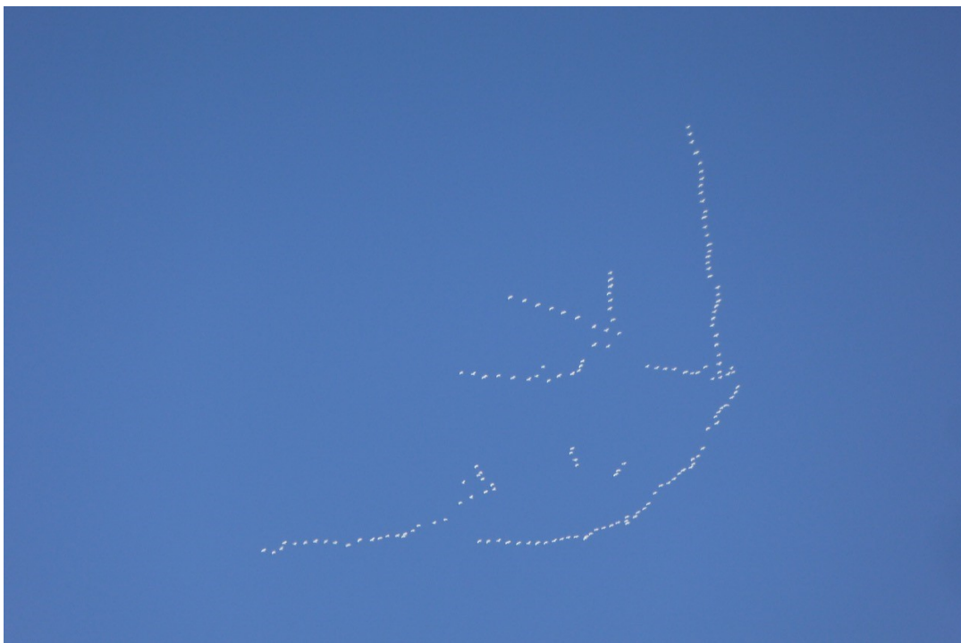
Snow Geese flying over Hamilton, MT, March 22, 2019.