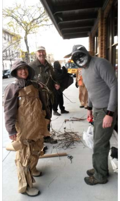
Bitterroot Auduobon members at the Festival of the Dead Parade in Missoula.

Squirrel, a Mountain Bluebird, owls, a Pine Marten, a raccoon and a Black Bear marching in the parade. We handed out over 900 educational Audubon stickers to parade bystanders.