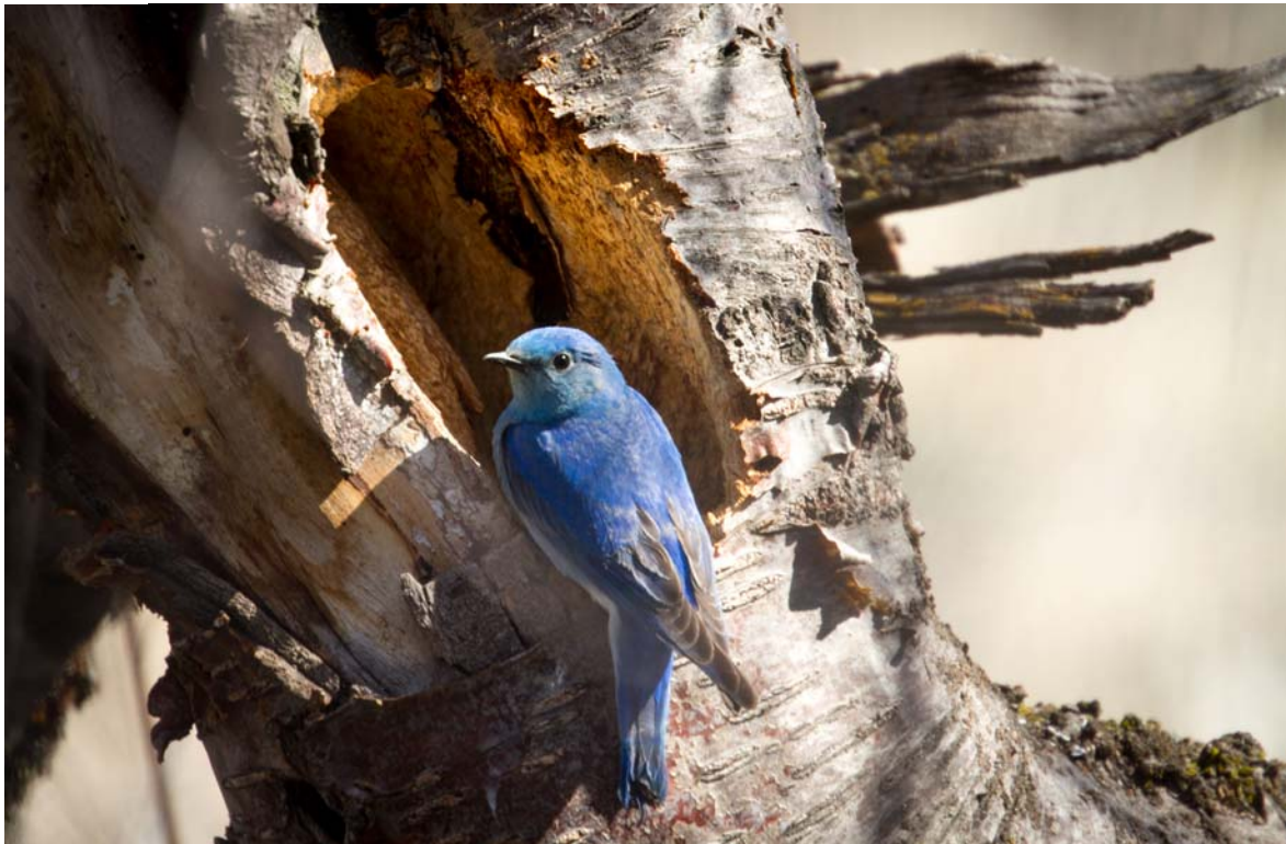
Mountain Bluebird at his cavity nest, April 2013, Corvallis, MT.

Oct 21- Audubon Meeting, Location TBD, 7PM, Board Mtg. 5PM