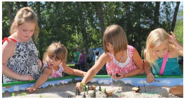
Kids participating in Riverfest activities.

BRWF has been operating in the Bitterroot Valley since 1994. You may know of BRWF from their annual "Riverfest", a day for children and families to learn about the importance of the river while having a