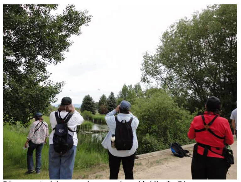
Bitterroot Audubon members creating a bird list for Bitterroot Springs Ranch

Bitterroot Springs Ranch is home to an amazing diversity of bird life, including a Great Blue Heron rookery with over 30 nests. In the breeding season, it is home to several of the species that define the Bitterroot River IBA, including the Lewis's Woodpecker, Red-eyed Vireo, Bald Eagle, Willow Flycatcher, and the Red-naped Sapsucker. Participants will have the opportunity to bird on the property after a few hours of work.