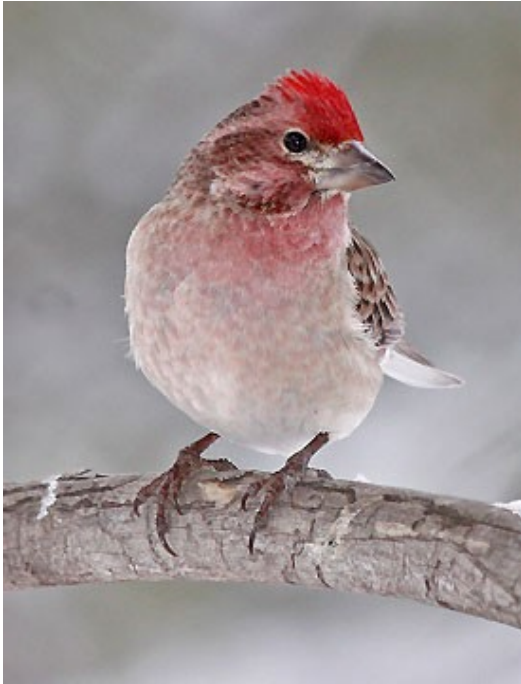
Cassin's Finch, AZ 2011 GBBC

15th annual count takes place Feb. 17-20, 2012