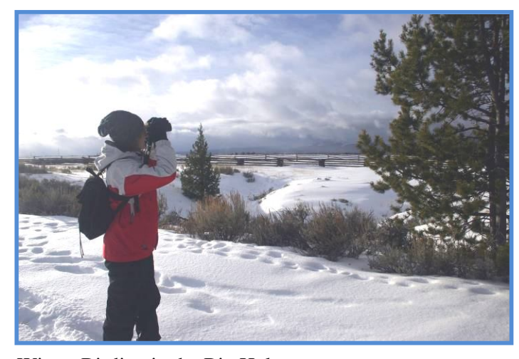
Winter Birding in the Big Hole

Twenty-six people participated in the 3<sup>rd</sup> annual Big Hole Christmas Bird count. Weather was warm for the Big Hole (24° F when we started) and stayed relatively nice for the day, with brief bursts of snow mixed with sunshine. The group observed 23 species, including seven species new to the count: downy woodpecker, golden-crowned kinglet, gray-crowned rosy-finch, gray jay, great gray owl, marsh wren, and northern flicker. The top species was the snow bunting, although the 126 we saw was fewer than the 195 seen in 2008. Next was the black-billed magpie (100) followed by the rough-legged hawk (93). A full species list is available on the Bitterroot Audubon website. Thanks to everyone who participated!